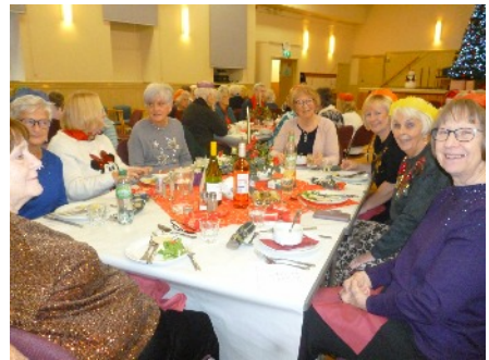
Guild Christmas Lunch