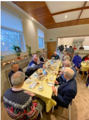
Men's Club Christmas Afternoon Tea