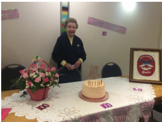
Celebrating her birthday at the Guild