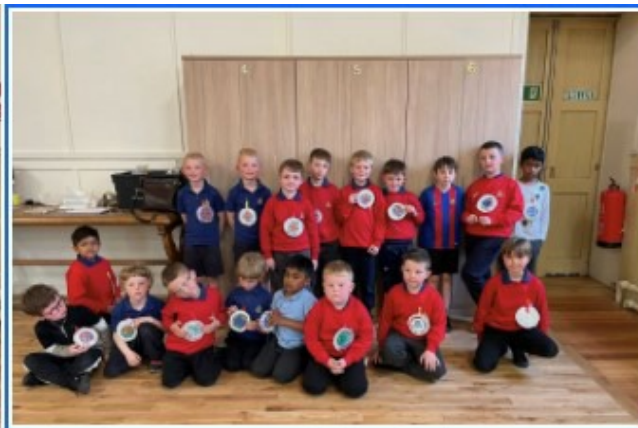
Anchor Boys Commemorating VE Day

Anchor Boys will be heading to Heads of Ayr for their Day Trip on Saturday 7 th June 2025. Fingers crossed for good weather.