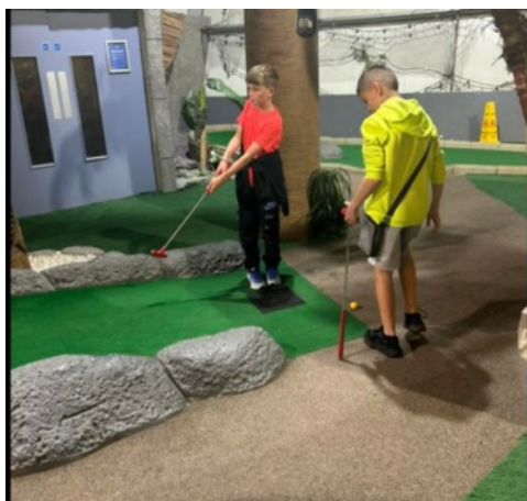
Company Section Crazy Golf