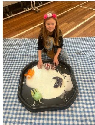
Messy Play in the South Hall

The Communications Team delivered another colourful, information packed Cadder Gazette and maintained our social media presence during the July to September period.